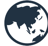
Learn a foreign language