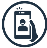
Develop digital skills