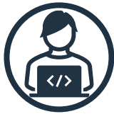
Learn technical designing and programming