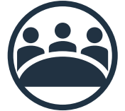
Earn additional credits by taking part in extra activities