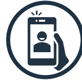
Develop digital skills